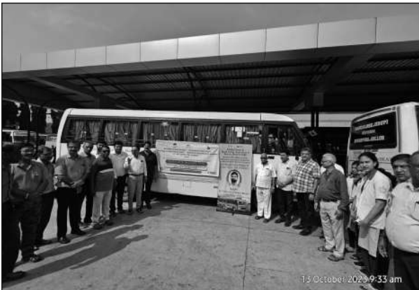
Free Eye Check up Camp conducted by our Club in the Service Bus Stand Hampanakatta