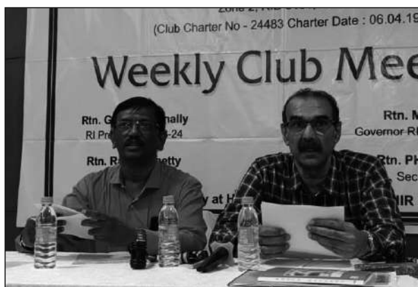
Annual General Body Meeting of the Rotary Mangalore Central Foudation