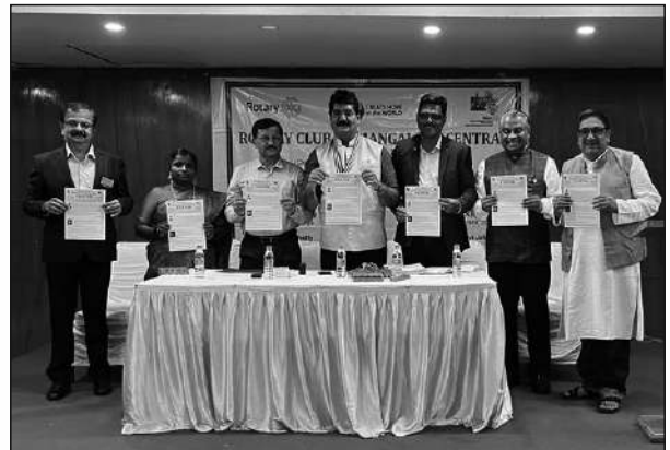
Release of Centor by the Host of Family Dinner Meeting of the Club for September