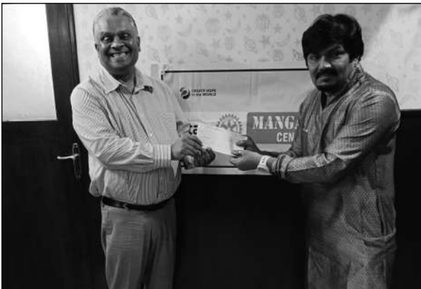
Donation of Rs. 9,500 to the SK Municipal Employees Union Dasara Celebration Committee by our Club