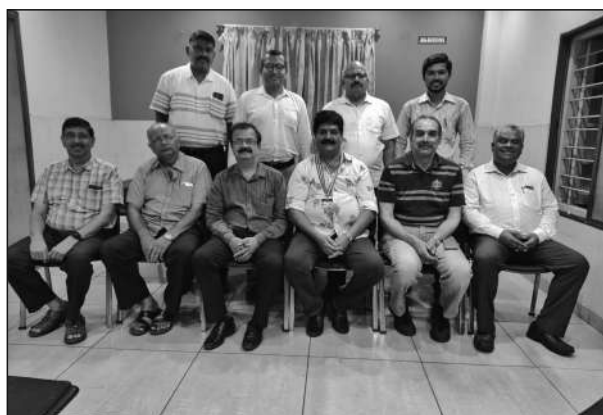
Board Meeting of the Club for October