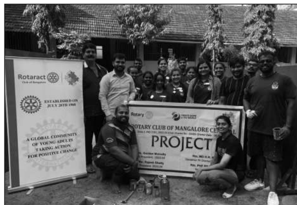
Beautification of St Peters High School, Kottara by our Club.