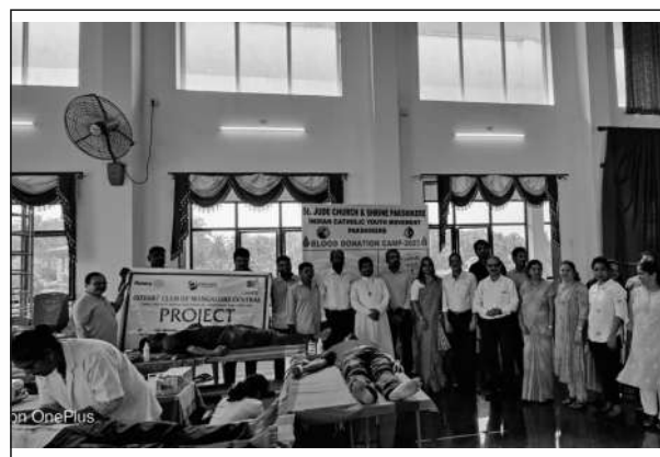
Blood Donation Camp and Health Check Up Camp conducted by our Club at St Jude's Church Hall, Pakshikere