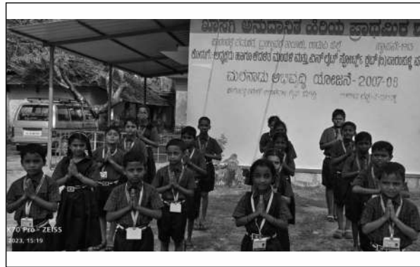
School Children of Udipi Zilla Panchayth Higher Primary School Parampally wearing with the uniforms donated by our club