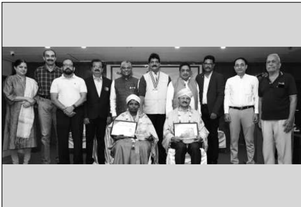
Presentation of Nation Builder Award to two Teachers in our Dinner Meeting for the month of September.