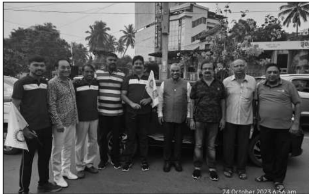
Our Club delegates in the World Polio Day Observation held at Mangaluru