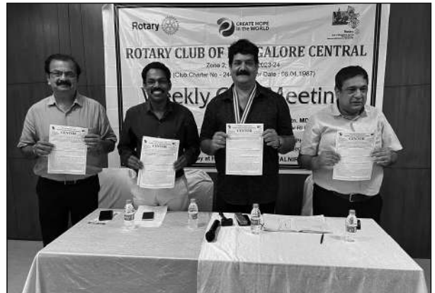
Release of Centor by Rtn Saji PR