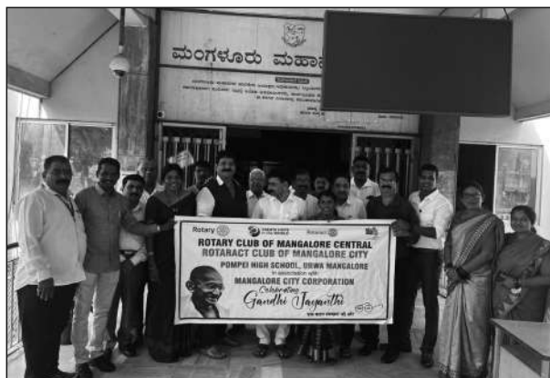
Gandhi Jayanthi Celebration by our Club in MCC Premises